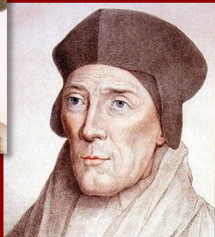
St. John Fisher

The fearless witness of Saint Thomas More and Saint John Fisher is especially compelling to American Catholics today, as we face threats to our religious liberty and rights of conscience. The relic tour is part of the broader Fortnight for Freedom. Come to learn more about the lives of these saints, ask for their prayers, and be inspired by their example.