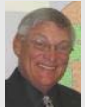
This article written by Ron Lill

2, If you're reading a printed paper copy of the InFormation and want to follow the links in any of our articles go on line to the news letter web site @ http://www.archphila.org/pastplan/INDEX/InFormationindex.html and follow the embedded links.